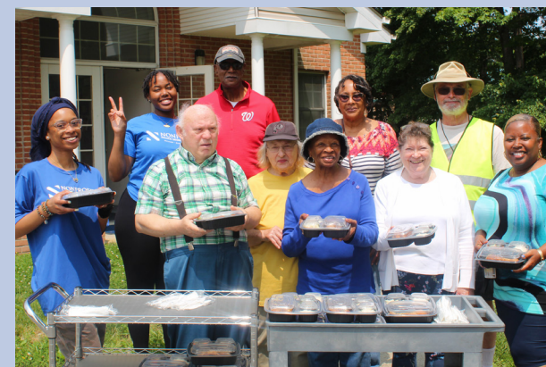
Stand Up & Deliver Prince George's Forward Distribution

Racial Equity Trainings - NPGC ED led 2 municipal trainings for the City of College Park MD focusing on racial equity. Engaged 30+ municipal employees and elected officials.