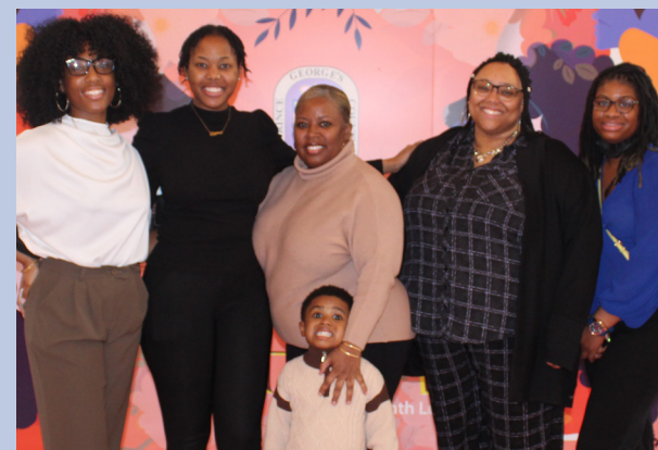
Annual Women's History Month Luncheon with NPGC Team