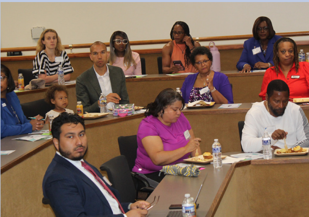
Breakfast with Tiffany Event with U.S. Senator Van Hollen and State Senator Benson