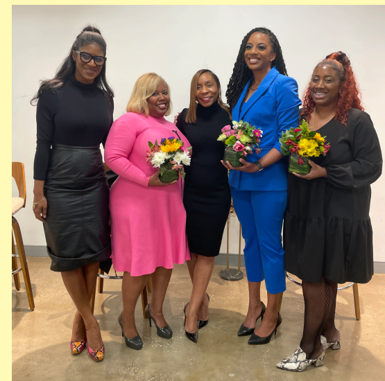
BLK ED Network - Her Story Panel Event