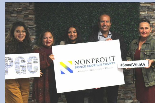
Maryland Latinos Unidos