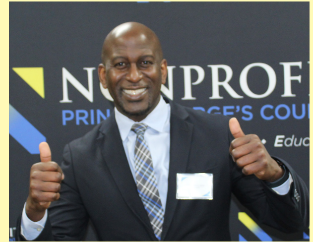
Mayor Benn Cann of Morningside Maryland